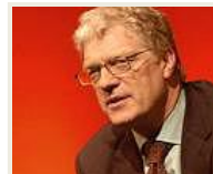
Sir Ken Robinson

While on a recent visit to Australia, innovation guru Sir Ken Robinson had some harsh words for traditional universities claiming they were still based on out-moded models. His book The Element , published earlier this year, looks at the careers of many well-known people and shows how badly served they were by traditional universities. To view a video of an extensive and riveting interview with Sir Robinson while he was in Australia, visit the Education.au newsletter issue .